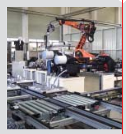
Spare parts for handling, welding and special purpose robotic systems