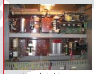
...any type of electric or electronic parts for high and low voltages and currents