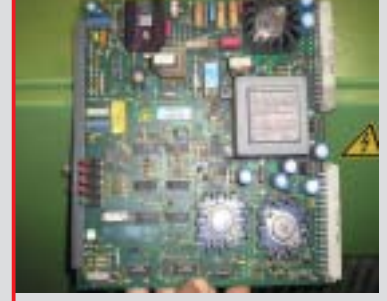
PCB cards for various tasks and from various makers