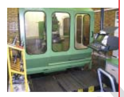
Spare parts for "Round Table" and other NC machines"